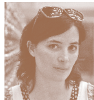
MILAGROS MUMENTHALER scalpelonline.net/0610

"Milagros Mumenthaler's slow-burning debut took the Locarno festival's top prize as well as the international critics' award. These accolades should kick off an extended run on the film festival circuit, especially at events keen on uncovering fresh talent." The Hollywood Reporter