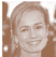
SANDRINE BONNAIRE scalpelonline.net/0611

Contact: Platige Image S.A. T: +48 228 446 474 E: produkcja@platige.com W: www.platige.com